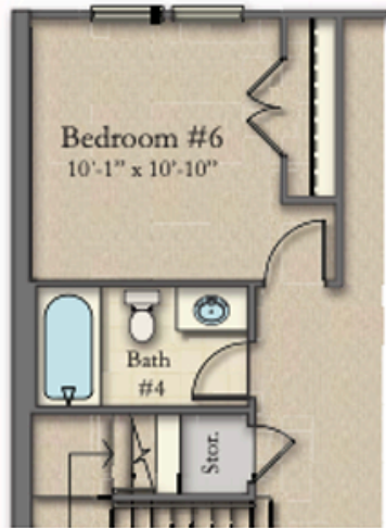
Opt. Bedroom #6 w/ Bath #4