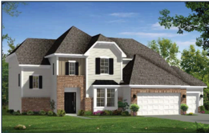
ELEVATION 5 (OPT. 3RD CAR GARAGE SHOWN)